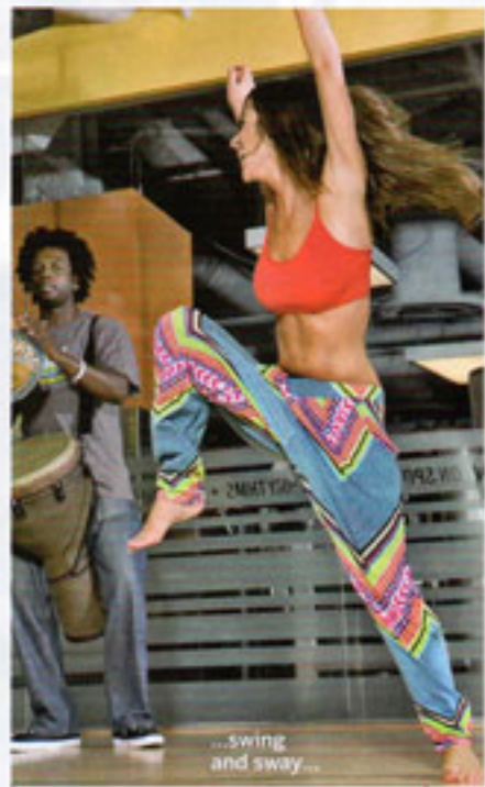
...swing and sway...